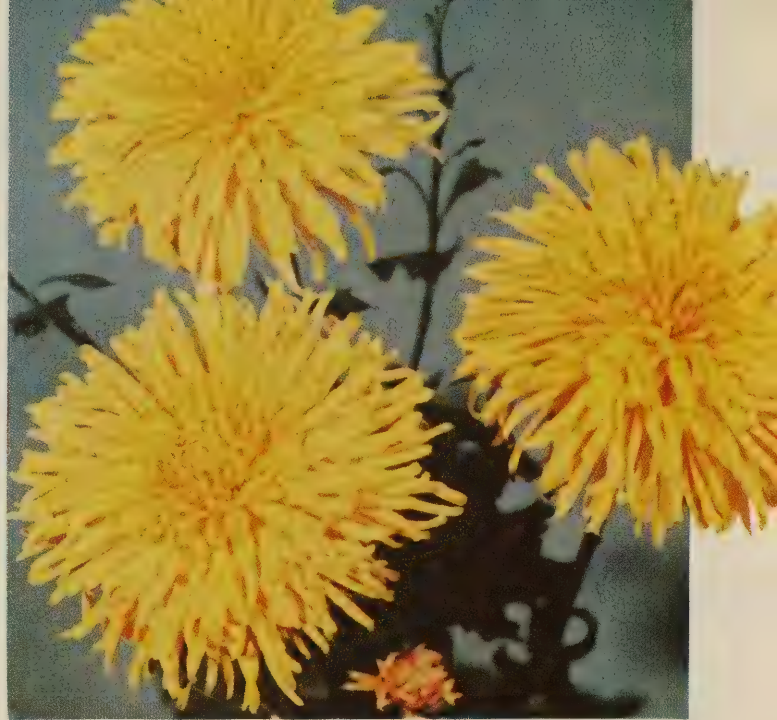
LEE POWELL. 60c each; 3 for $1.50